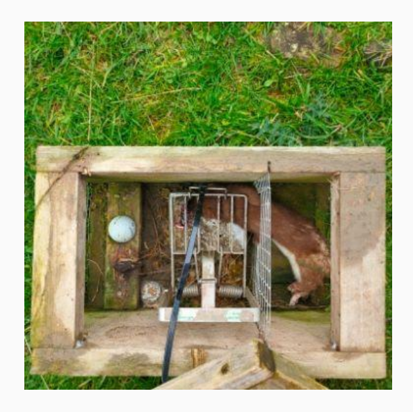
One of the stoats caught recently by Community Trapper Fi Bowler in Te Awaiti Bay