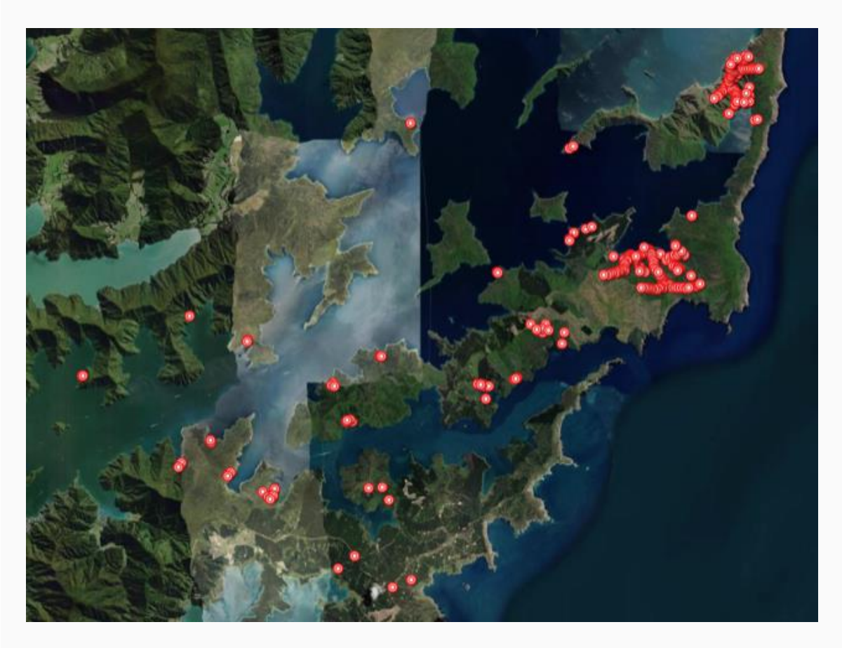
Map showing all the Arapaoa Kiwi trap locations