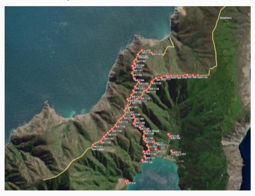
Our trap network at the top end of East Bay (June 2023)

Further A24 traps will be installed on the ridge towards Cape Koamaru and on the SW ridge when weather and time permit.